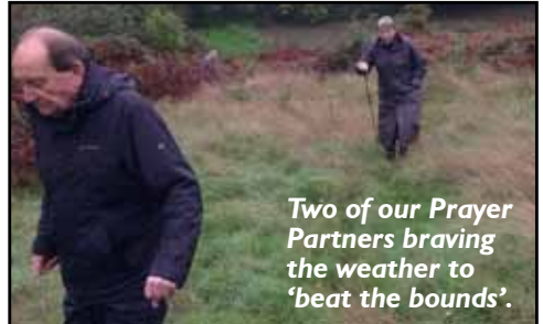
Two of our Prayer Partners braving the weather to 'beat the bounds'.