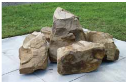
Stones for the Cairn, taken from underneath Poustinia