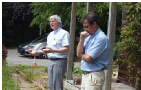
Prayers of thanks are said for Poustinia