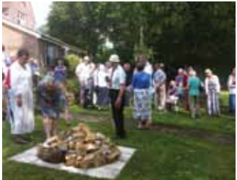
Folk gather around the cairn to lay their stones of thanksgiving