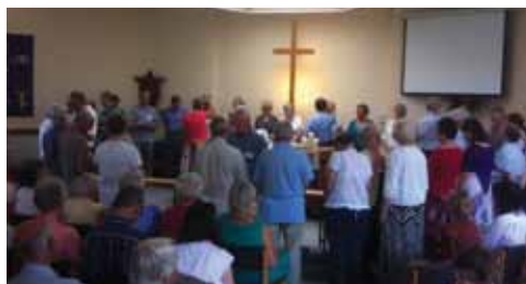
Trustees and Ministry Team are anointed

During the service the Trustees and all those involved in ministry were anointed.