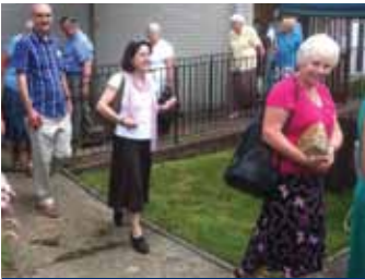
Carrying stones to the Cairn