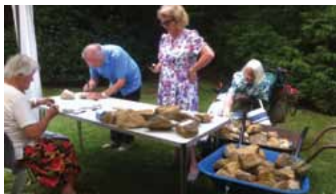
Folk write words of thanksgiving on their stones

It was now time for the eagerly awaited building of the Thanksgiving Cairn. Steve C said that folk who were unable to be at Thanksgiving Day had been sending in messages to be put on their stones.