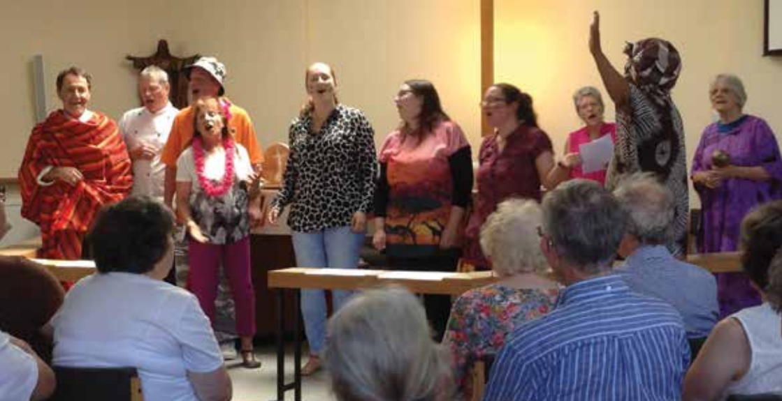
Some of the Crowhurst team singing 'The Circle of Life' on Thanksgiving Day in July