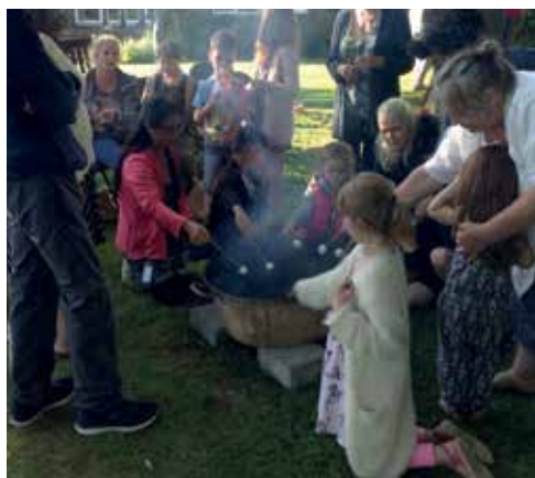
The always popular marshmallow toasting!