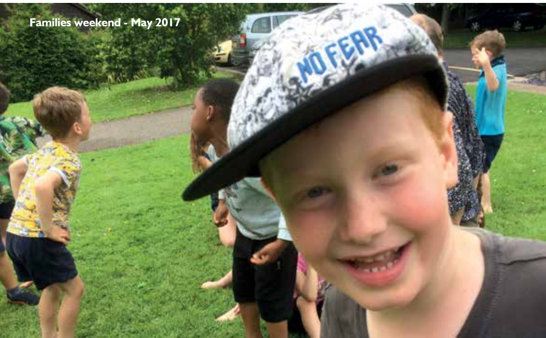
Families weekend - May 2017

While this magazine is issued free of charge, an annual donation of £10.00 to cover costs is most helpful. If you are able to Gift Aid your donation, this adds another 25p for every £1 you give.