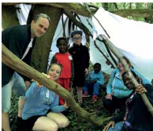
During the skirmish to the woods, one of the tasks was to create a den. This one should keep the rain out!