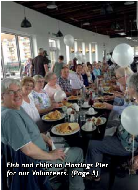
Fish and chips on Hastings Pier for our Volunteers. (Page 5)