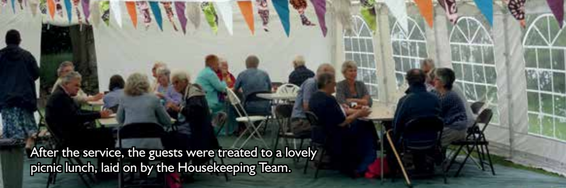
After the service, the guests were treated to a lovely picnic lunch, laid on by the Housekeeping Team.