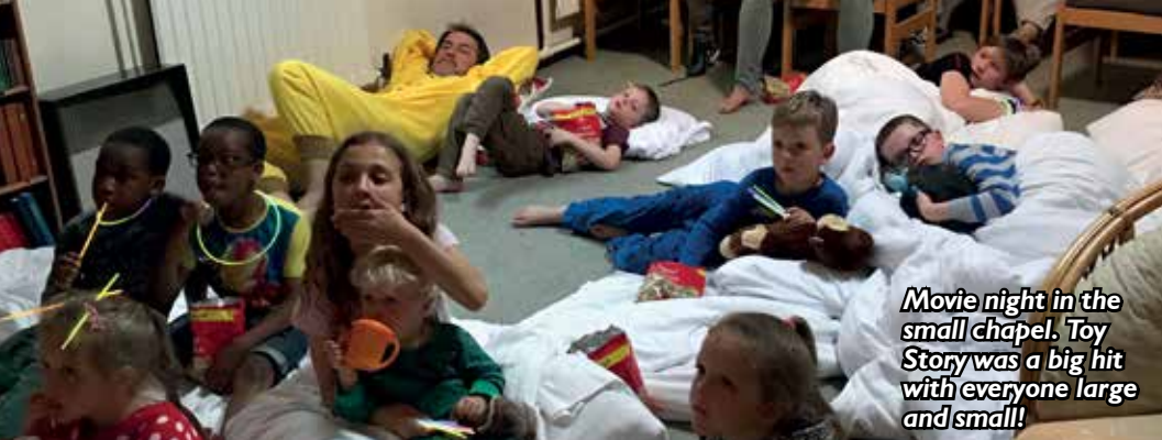
Movie night in the small chapel. Toy Story was a big hit with everyone large and small!

Below are some of the families' feedback on their best bits!