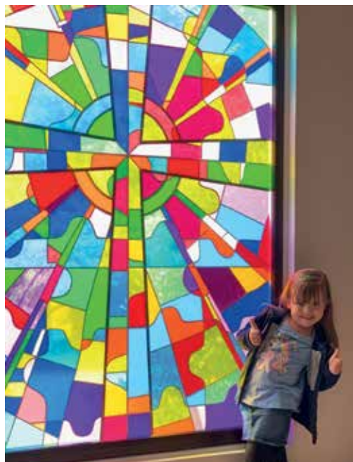
Check me out!