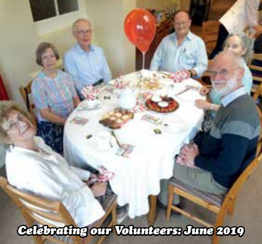
Celebrating our Volunteers: June 2019