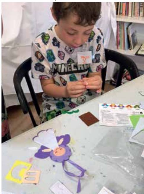
Deep in concentration.