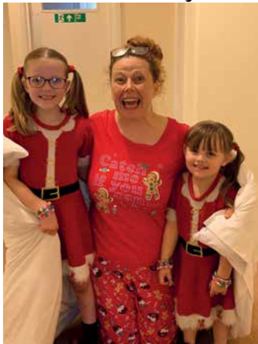
Christmas in May!