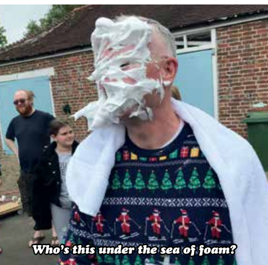
Who's this under the sea of foam?