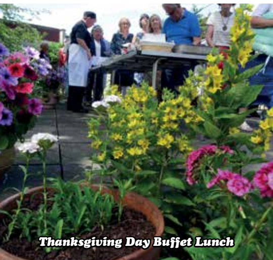
Thanksgiving Day Buffet Lunch