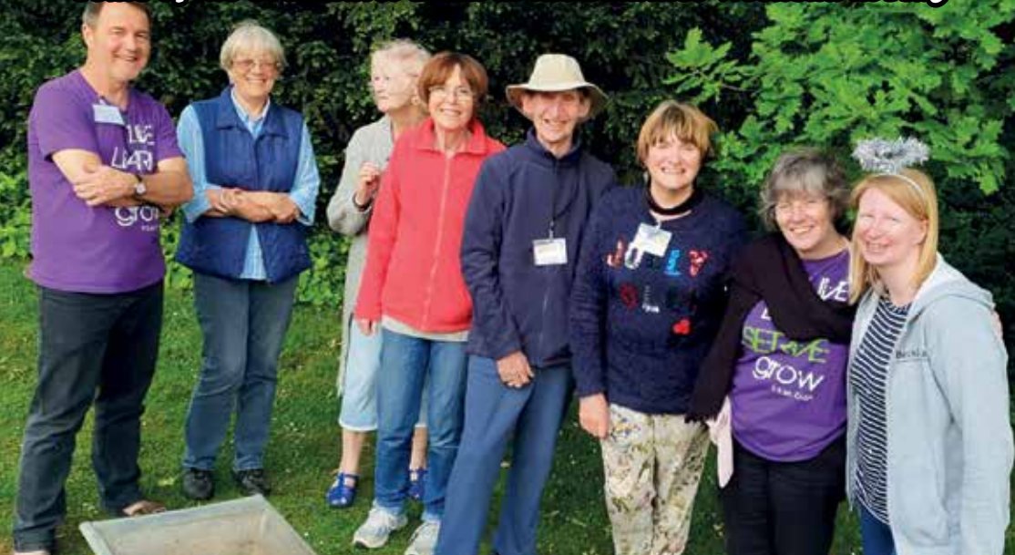
Some of the Crowhurst Team at the Families Weekend in May

While this magazine is issued free of charge, an annual donation of £10.00 to cover costs is most helpful. If you are able to Gift Aid your donation, this adds another 25p for every £1 you give.