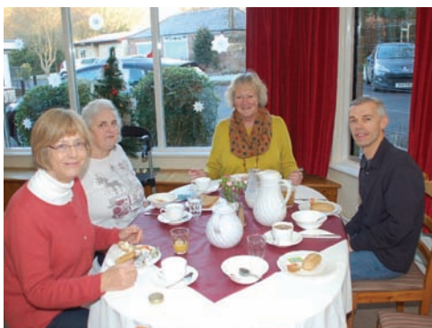
Guests on the New Year Celebration, enjoying a leisurely breakfast (Page 15)