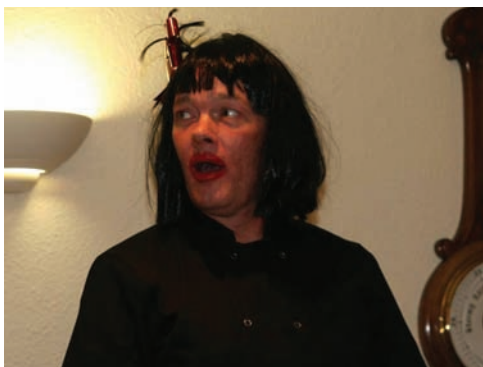
'Mirror mirror on the wall!' (Who is this rather stunning Snow White? (Page 7)