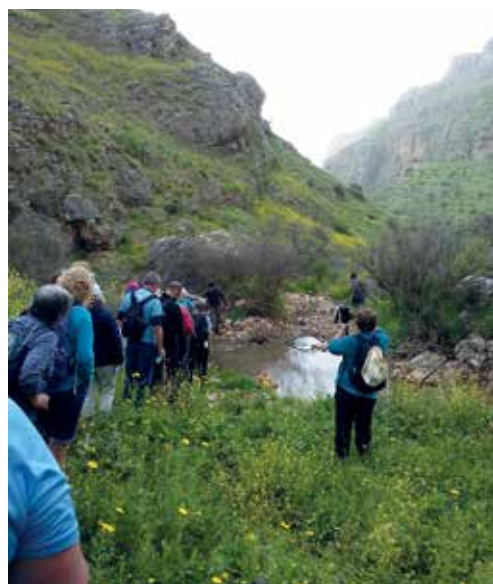
Walkers going through Wadi Haman on the way to Galilee.