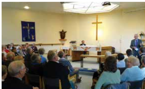
Thanksgiving service for the new art room