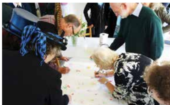
Folk leaving their marks; finished canvas below!