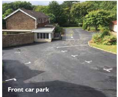
Front car park

thing - autumn is on the way. This is where our wonderful volunteer gardeners come into their own, spending several weeks raking a seemingly never ending supply of fallen leaves (and a surprising increase in the number of acorns!), which by this time next year will have turned to a lovely mulch.