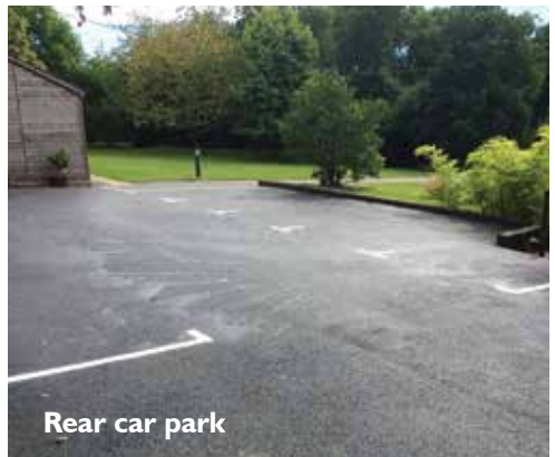
Rear car park

The well at the back of the house is still waiting for a new roof, which we would like to get done by Easter next year.