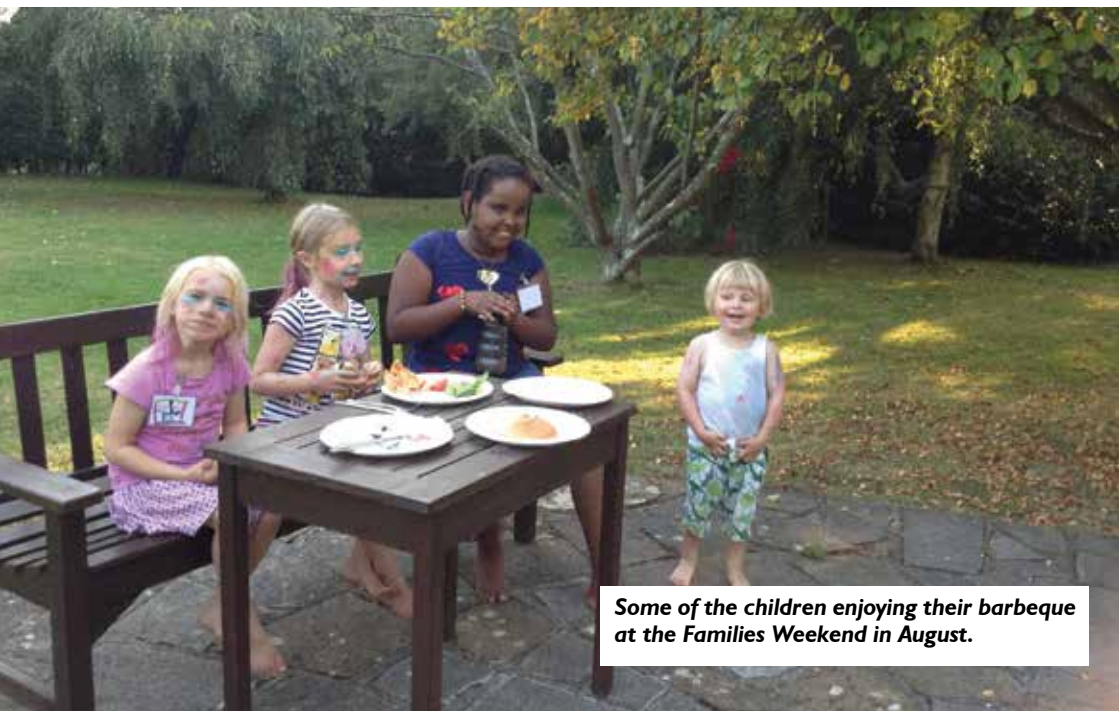
Some of the children enjoying their barbeque at the Families Weekend in August.

While this magazine is issued free of charge, an annual donation of £10.00 to cover costs is most helpful. If you are able to Gift Aid your donation, this adds another 25p for every £1 you give.