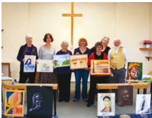
March week: guests with their paintings.

We explored the picture language in the "Song of Songs" and with the Lord's help, many wonderful paintings were produced. We always stopped for prayer when we