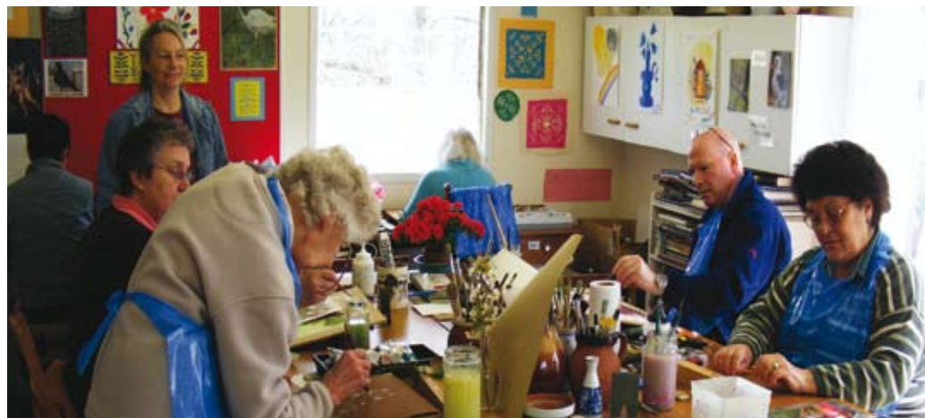
April's guests deep in thought and creativity