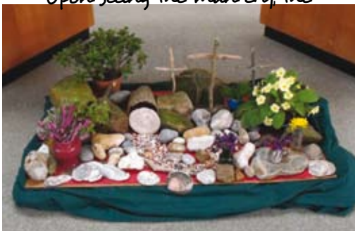
The Easter Garden