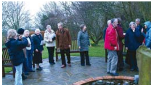
Easter Sunday, early morning service.