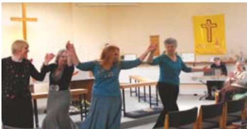
Easter Sunday morning service; a joyful celebration of the Lord's resurrection.